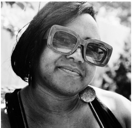
Ann Rosen, Anthea , 2020. Archival digital black and white photography, 8" x 8".

"Global capitalism is a multi-headed snake that links class, race, and gender. We need a total worldwide system change, one that puts humanity front and center. Until this happens we will have more pandemics in the future."