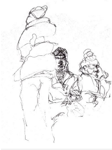
Jess Frederick, Sketch from Notebook , 2016. Ballpoint pen on paper, 8" x 10".