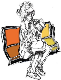
Jess Frederick, Woman , 2016. Pencil, ink, and digital media, 8" x 10".